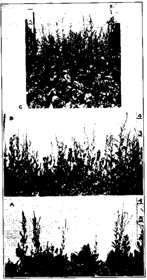
(See next page)