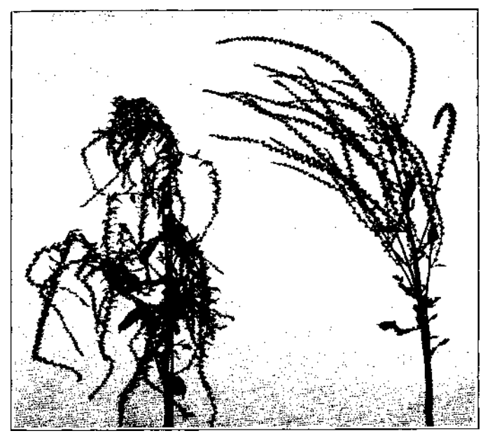
Figure 1.—Interaction response of phosphate and nitrogen on sugar-beet seed in southern Utah. High ultrogen with no phosphate (left) causes work succellent steins, uneven maturity of the seed, and late vegetalive growth. None of these undesirable effects occurs when sufficient phosphate is added to balance the mitrogen.

increase in yield of seed as compared to the check was 1,194 pounds per acre. It is evident that this increase is almost 300 pounds greater than the total of the individual responses, and that it would be im-