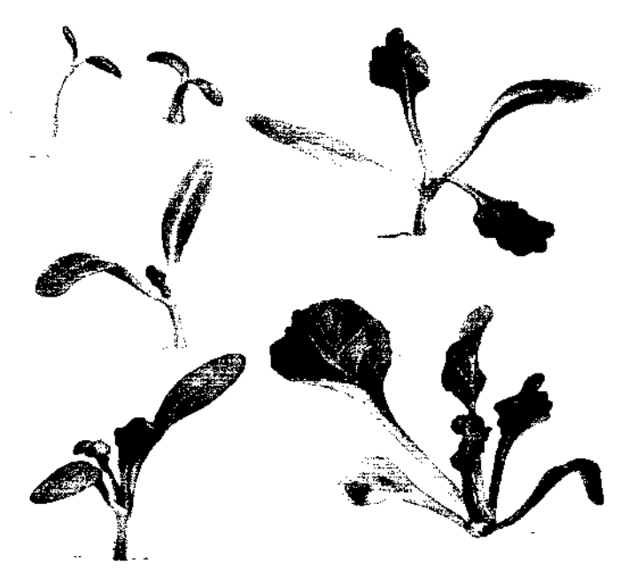
Figure 3.-Appearance of beet seedlings developing from colchicine-treated seed