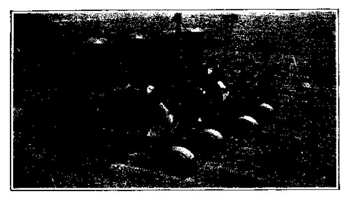
Figure 5.—Putting in planter plots with McCormick-Deering No. 40 sugar beet planted equipped with furrowing disks on the front of the l wo left disk openers and with furrowers behind the openers; on the two right openers.

Plantings P and Q were put in with the McCormick-Deering No. 40 planter with the regular deep concavity press wheels. Planting Q was with the planter operating normally and with depth bands set in l^1/4 inches from the edges of the disks. The press wheels used on the John Deere No. 55 planter were of the flat-beveled-rim type giving only slight concavity to the pair.