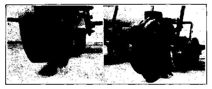
Figure 4.—Disk furrow openers with left disk removed to show small, moist soil, seed covers between disks. On the left is a single side coverer and on the right a double coverer. These coverers were designed to bring in a small amount of moist soil from the bottom of the furrow and cover the seed with it before dry soil fell in, but the devices did not improve germination significantly.

straight seed tubes were used. Depth was controlled in the usual manner with depth bands set in 11/2 inches from the edges of opener disks, giving 1 he actual planting depth of approximately 11/4 inches. On B the planting depth was controlled with the press wheels and was supposed to have been the same as A, but actually was deeper. Plantings C and D were with small, seed coverers which were developed to work between the opener disks and bring in a small amount of moist soil over the seed from the bottom of the opened furrow before dry surface soil fell in on the seed. These coverers were made single to bring in soil from only one side and double to bring soil from both sides. A special double set of V-rim press wheels were used for E in an attempt to obtain better covering and firming of the soil around the seed.