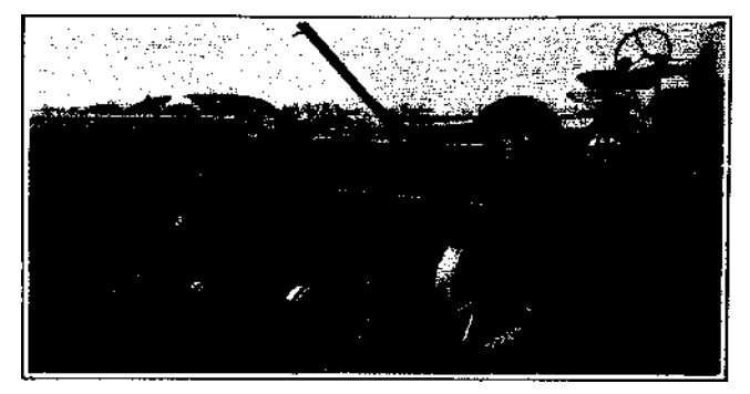
Figure 3.—Putting in planter plots with John Deere No. 55 sugar beet planter equipped Willi special planting equipment—two left openers with furrowers behind disk opener; right center is regular opener; right opener with V-rim press wheels.

had good moisture up to about an inch and a half from the surface. This seed bed had been worked up with a duck foot and spike tooth harrow lo dry it out and give a seed bed with the surface on the dry side. However, rains followed which brought the moisture up to an optimum for germination and in that way did not give the dry planting we desired. The third was put in on June 29 and 30, which was the earliest that our seed bed could be put in a condition where it was definitely on the dry side and we were sure germination would be low with standard planting. There were some light showers on this planting but none ever wet down to the seed and the results were very different with different equipment.