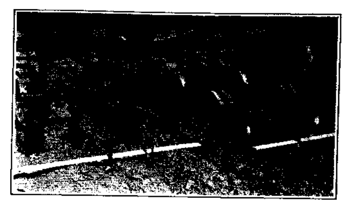
Figure 6.- Equipment used for putting in the covered or ridged row. sugar beet, plantings. The two left openers have the largre ridging disks and the two right the smaller disks. Ridges must be removed by about the fourth dav after planting-before the sprouts get up into the ridges.

and increased germination. Water on the seed seemed to depress germination slightly on both sets of plots but not significantly so. For some reason the germination of both wet and dry decorticated seed on the second set of plots was significantly different and significantly below the regular plantings with segmented seed.