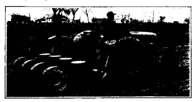
Figure 2.—Ford-Ferguson experimental single-seed sugar beet planter under development in 1945.

The Rassman planter was a regular Rassmann unit built last year. The Ford planter was an experimental machine under development by Ford-Ferguson. It mounts directly on the rear of a Ford tractor and has horizontal seed plates driven by V-belts from press wheels of about 18 to 20 inches diameter. The openers are combination shovel furrowers and small runners. The Cobbley planter was this year's new Cobbley units mounted directly on John Deere No. 55 double disk openers. The seed tubes curved back slightly between the opener disks just enough to clear the disks and drop the seed in the opened furrow rather than in the V between the disks. Planting 29 was with a unit of Mervine's pick-up cup, single seed planter built several years ago.