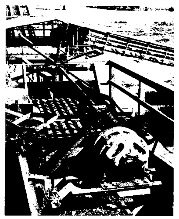
Figure 2. The pilot model of the fluted roll screen was a level bed of ten oppositely rotating rolls, 4 inches in diameter. A 15 HP motor drove the rolls and paddle wheel for transferring discharged beets.

Along with the mechanical harvest had come a reduction of quality standards of delivered beets. This reduction in standards led inevitably to a relaxing of cultural standards in the fields. The result was that thinning and hoeing operations were generally limited so as to produce crops which would submit to mechanical harvest but which would present a minimum cost of field operations.