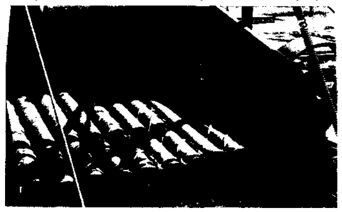
Figure 6. The roll screen installed at the Isleton dump handled close to 19,000 tons without major repairs.

During the latter part of the piling experience a problem with grave implications presented itself. As the rainy season approached, muddy beet loads became increasingly frequent. Certain types of sticky clay when present in the load would so envelop the rolls as to bind them completely and stall the 20-H.P. driving motor. There was a striking contrast between moist dirt and dry dirt in relation to the machine's performance. The capacity for