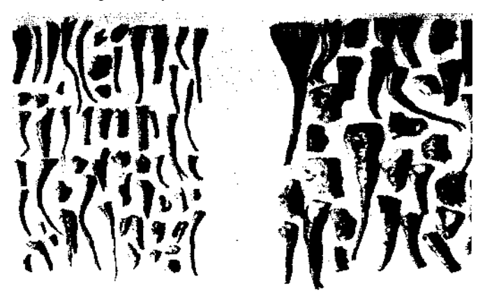
Figure 4. Left—beet fragments delivered by the fluted roll screen. Right—beet fragments delivered by a conventional Rienks screen. The fluted roll screen delivers more fragments than does the Reinks

Some rather astonishing results emerged from these early trials. The bed of rolls extracted very nearly 100 percent of all material other than sugar beets, including artificially introduced masses of soil, mud, rocks, weeds and