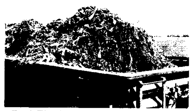
Figure 1. This car load of beets illustrates the extreme amount of trash delivered by mechanical harvest. Conventional screening methods are ineffective on such trash.

The management of the Spreckels Sugar Company as early as 1946 recognized the need for coping with the rising tide of trash delivered with the mechanically harvested beets. Discussions were held to determine the most effective method of attacking the problem. Ihe management was agreed that the ideal situation would be to so alter mechanical harvesters as to prevent their delivery of anything but clean beets. Unfortunately, a realistic examination of the problem revealed that the mechanism of harvesters was not so much the cause of excessive trash as were the cultural habits of growers which had been created by the advent of mechanical harvest.