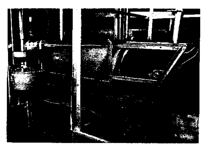
Figure 1. A continuous spray type seed treater.

for the purpose of ascertaining the operating pressure and/or degree of erosion of the nozzle orifice currently being used. The floor plan for the installation of the treater and the equipment therewith, called for fitting the treater into, and making it an integral part of, the exising seed processing equipment. A hopper was constructed near the gravity table so that processed seed could be discharged, if desired, directly into it and transferred by airlift to the treater seed supply tank. Alternatively, seed from selected lots which had already been bagged could be fed into this hopper