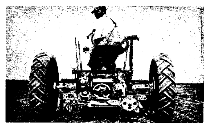
Figure 3.—This rear view of the Marihart thinner shows the drive system, generator and control boxes which activate the selective hoeing accomplished by this machine.