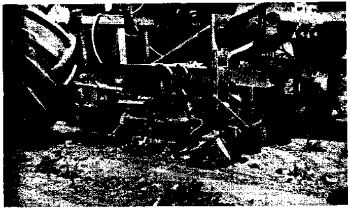
Figure 2.—This view shows the "electric eye" which picks up the light reflection from a plant and relays an electrical impulse to a control box which governs the actual hoeing through a system of sprockets, clutches, electrical controls and spring-mounted cutters. The hoeing will take place on both sides of the plant to be left.