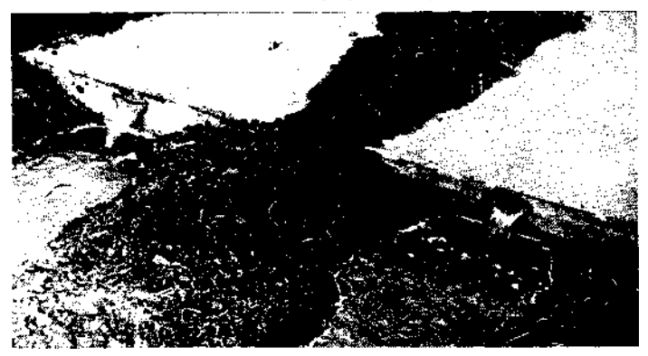
Figure 4.—Irrigation for germination is standard practice with bedplanted beets. These small sheet metal dams control the flow of water when there is considerable slope to the field.

Fall plowing and deep chiselling in two directions with the second chiselling at right angles to the first. (This aerates the soil and provides sufficient loose soil for proper listing of uniform beds.)