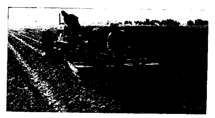
Figure 3.—Flattening the tops of beds and producing the final contour of the beds is accomplished with this bed-shaping tool.