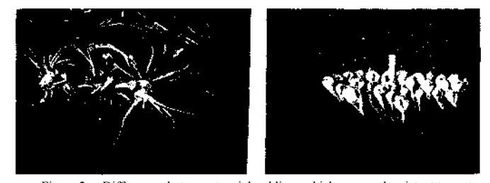
Figure 2.—Differences between two inbred lines which appeared resistant to root rot when looking at top growth.

Significant negative correlations were obtained between sodium and sucrose in 1952 and 1953, and in 1952 between sucrose and potassium, which is in agreement with the findings reported by Doxtator and Bauserman (9).