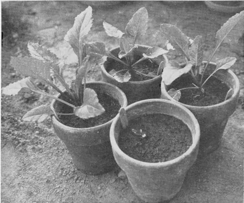
Figure 1.—Three thrifty progenies, background, of a Beta maritima x B. procumbens hybrid resulting from pollination with sugar beets. A weak progeny, foreground, of a red table beet x B. procumbens hybrid, resulting from pollination with sugar beets.

which could have been transmitted from either parent of the original hybrid. Under cold temperature, 50° to 55° F., and short day length, the plants show no signs of bolting.